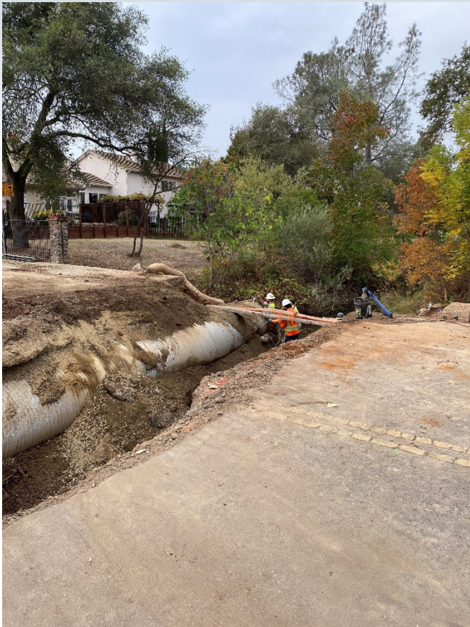
Existing deteriorated and failing corrugated metal pipe (CMP) on El Don Drive.